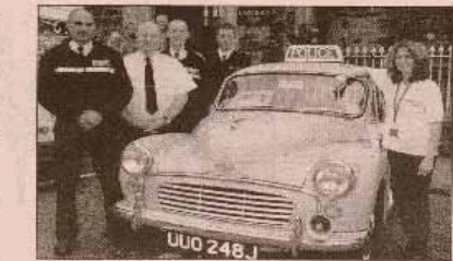
ABOVE: Staff at the public facilities in Tavistock's new park.