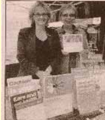
ABOVE: Several organisations offer 1-800 numbers in the Royal Hallmark Institute for Great Devon (DASH) and volunteer staff support.