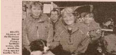
RIGHT: Members of the Tavistock House Group's Theatre group with words that come from the heart of the...