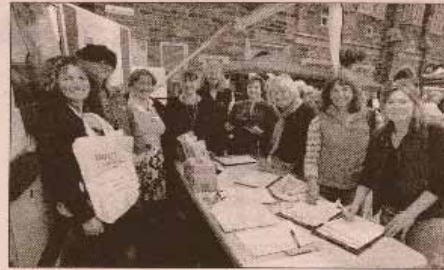
LEFT: Parents are well meaning West Devon Borough Council's used as the necessary day.

Representatives from Devon Air Ambulance, the Fire Service, Devon and Cornwall Police, the Tavistock Children's Centre, Tavistock Youth Fund, the Tavistock Community Support Centre, Tavistock Area Support Network and the Children's Advice Bureau were on hand to help the organisations showcasing the services of children and young people.